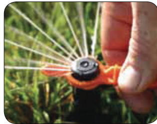
Easy arc adjustment.