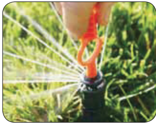
Easy radius adjustment.